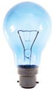
a light bulb